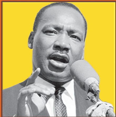
Students Honor Dr. King by Completing Service Projects Throughout the School and We Look Back at a Very Special MLK Experience