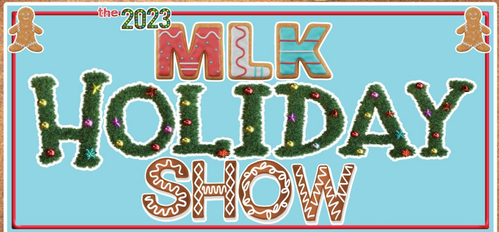
Students of All Ages Perform in the Annual MLK Holiday Show